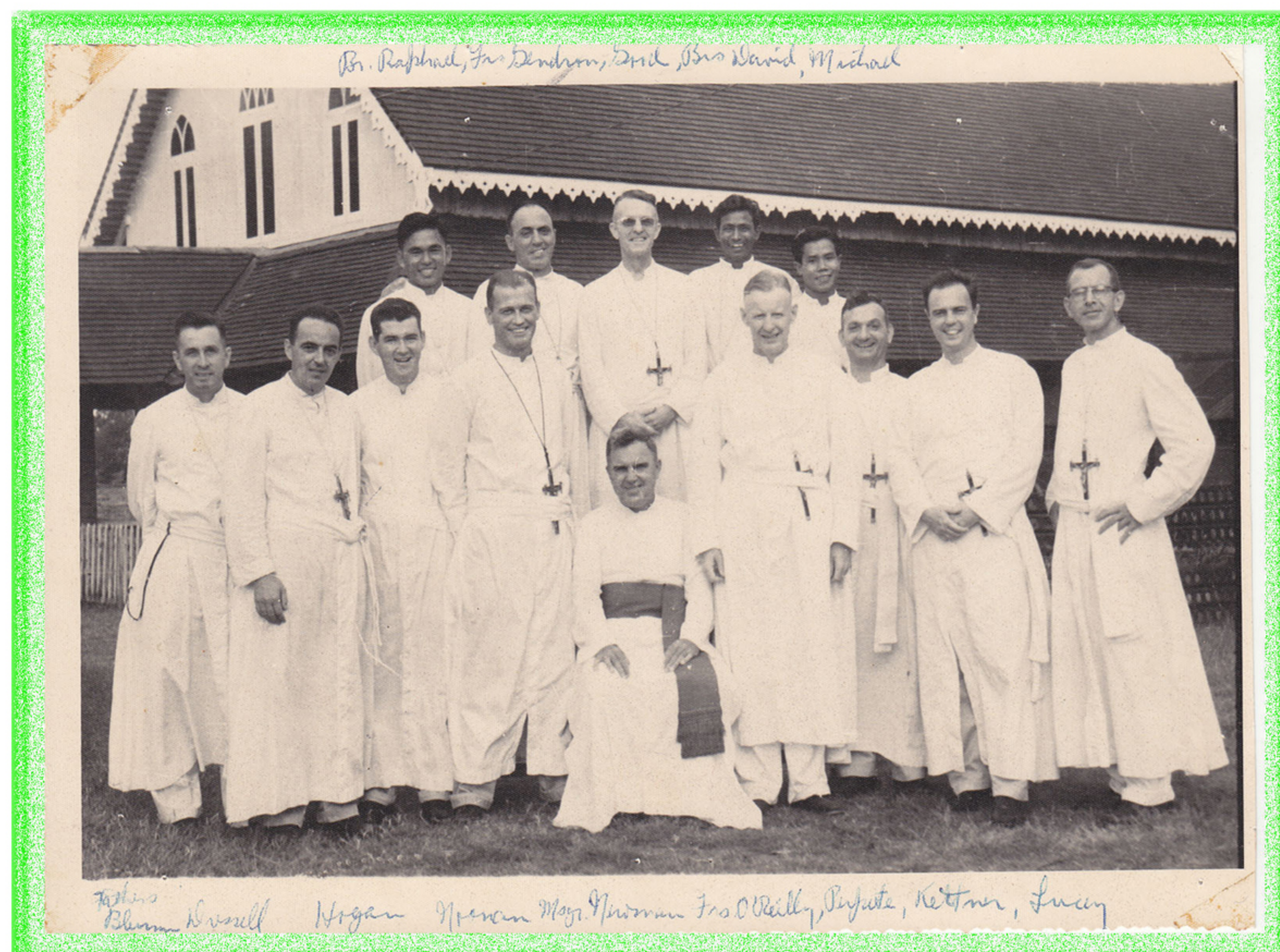
La salettes in mission