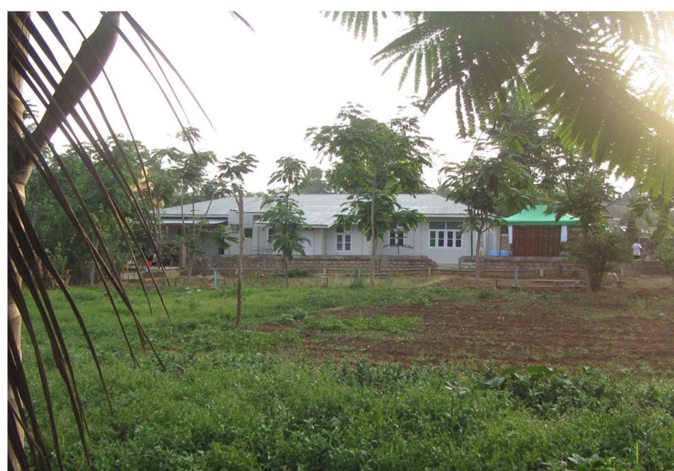
Formation House Pyin Oo Lwin