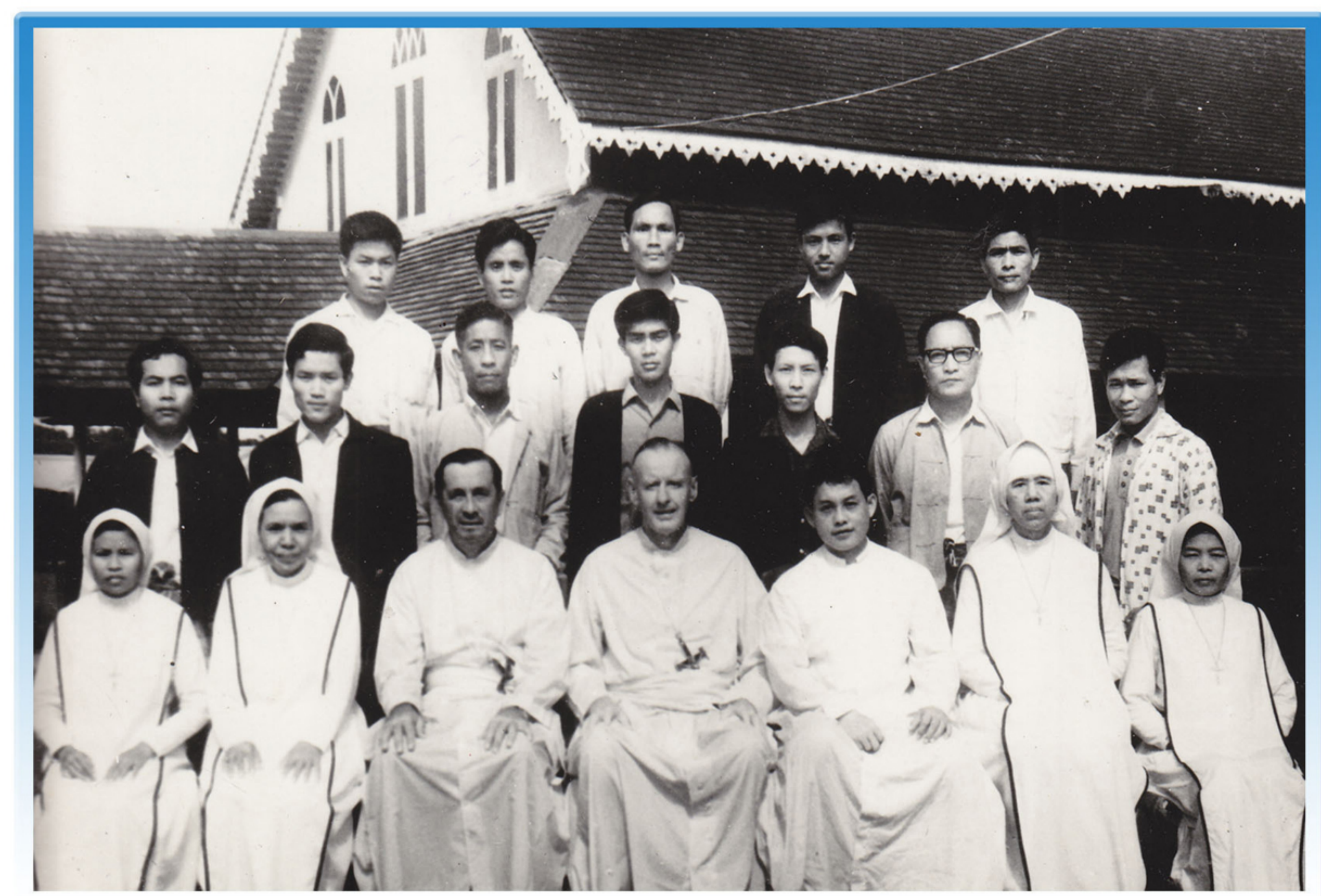
Missionaries seminarians & RNDM sisters