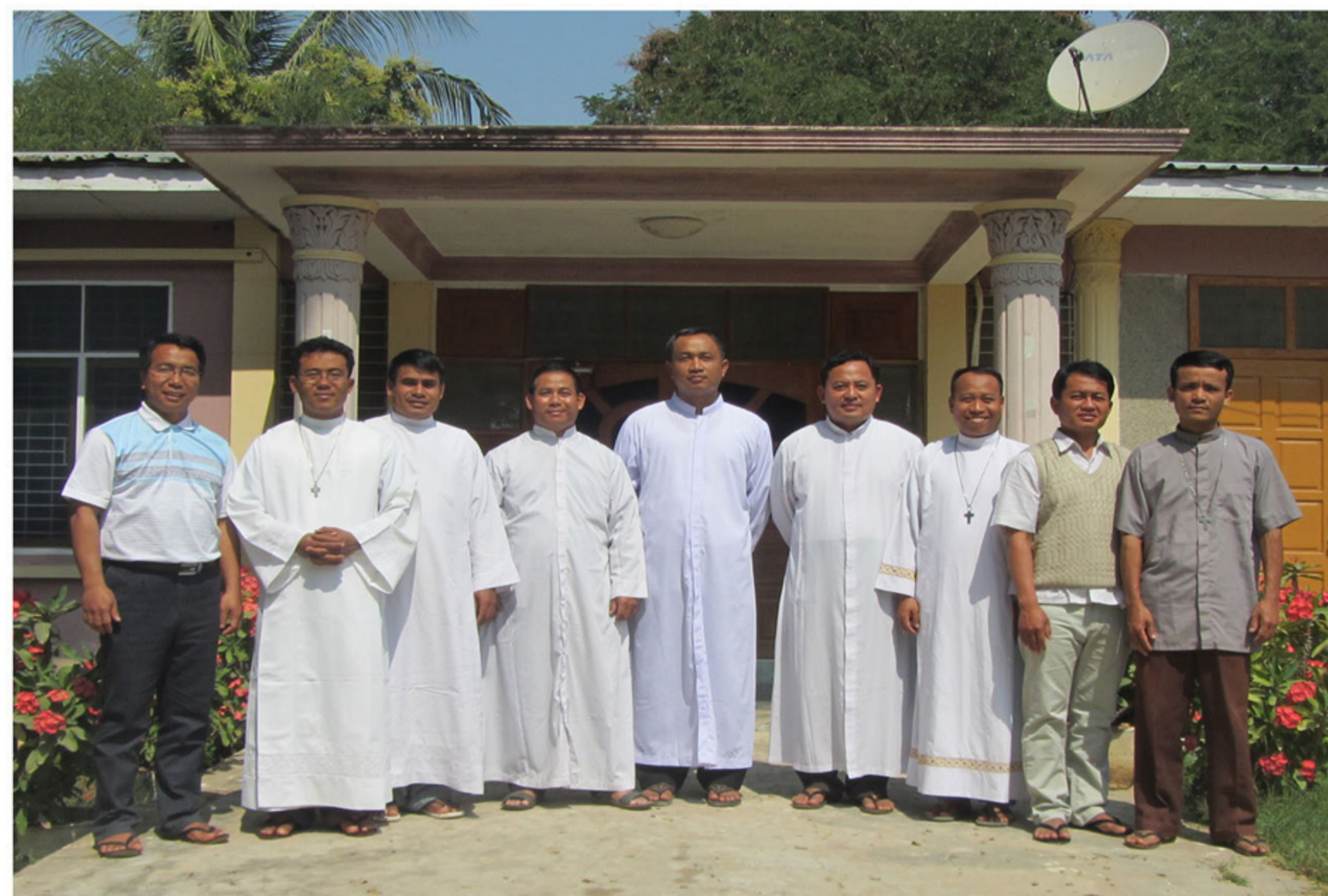
Chanthagone Shrine, Mandalay